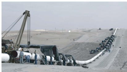
Piping Project - Lusail