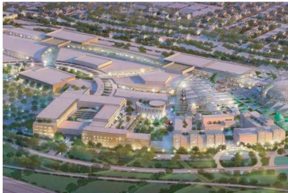
Doha Festival City Project