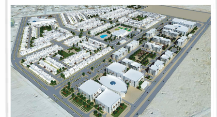
Student Housing Project - Qatar University