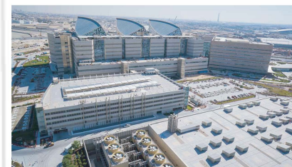
Sidra Medical & Research Project