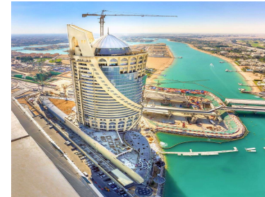
Falcon Tower Qatar Project