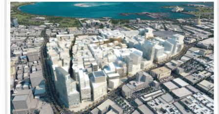
Msheireb Phase 4