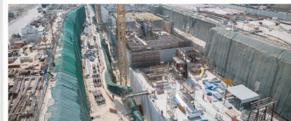
Red Line Metro Project