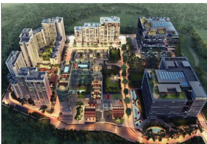
The Trees (Super Premium Apartments)