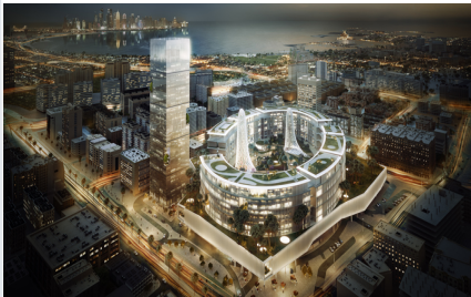
Doha Oasis Project